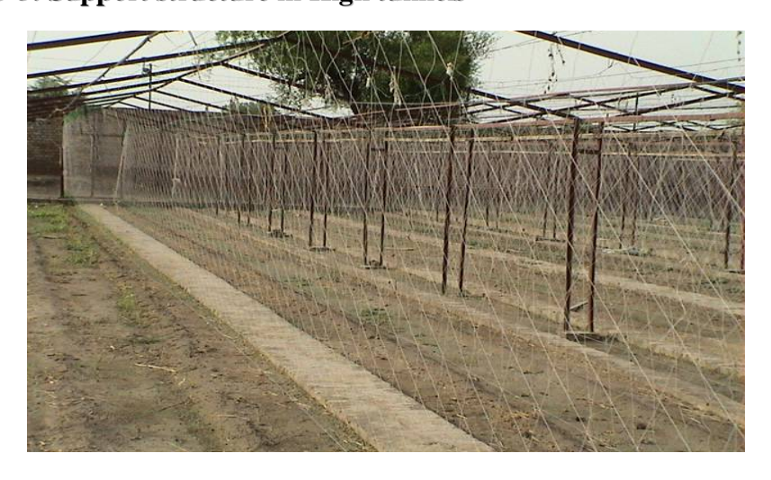
Figure 3-5: Support structure in High tunnels

Each tunnel will be 190 feet long, 11 feet high and 7 feet wide. The tunnel is built by pipe material of 40-mm diameter 20-25 feet length. The tunnel will be 11 feet high from the centre and 7 feet high from the sides. Each tunnel structure will then be covered by 0.10-mm thick and 20 feet wide plastic sheet. Approximately 6 tunnels can be constructed on an acre of land.