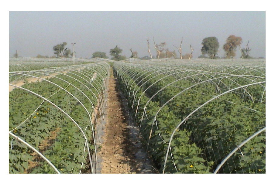
Figure 3-3: Walk-in Tunnel<sup>5</sup>

Walk-in tunnels are lower than the high tunnels but they are gaining popularity as they provide high yield compared to low tunnels. The tunnel is suitable for growing tomatoes, cucumbers, sweet pepper and hot pepper.