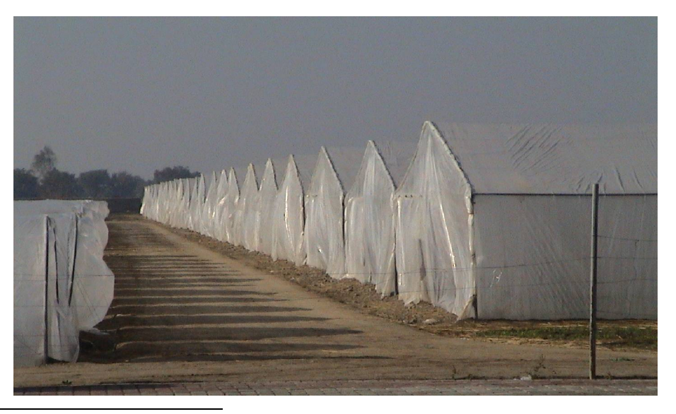
Figure 3-4: Picture of High Tunnel<sup>6</sup>

High tunnel facilitates easy access for soil preparation, picking and spraying due to its width and height. The crop yield is maximum in this type of tunnel. The tunnel is suitable for growing tomatoes, cucumbers and sweet peppers.